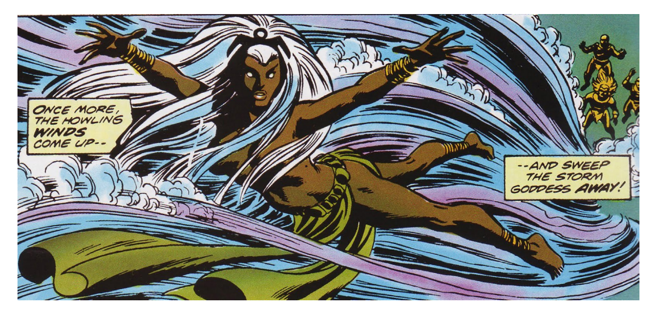
Figure 1: Storm in her first appearence, Giant-Size X-Men #1, 1975:14. Copyright © 1975 Marvel Comics.

In Storm's first appearance, a sexist and stereotypical appeal is noticeable that Barbosa (2010) uses to point out sexual politics as one of the bases for the black feminist movement: despite equally sharing the cover space with her team partners, Storm's breasts are exposed (see Figure 1 ).